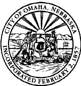
Mike Fahey, Mayor City of Omaha